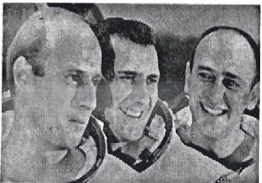
The Apollo 12 astronauts are in obvious good humor as they take a break from training at Cape Kennedy Space Center before blast-off time for the moon trip Nov. 14. Left-right are Charles Conrad Jr., Richard F. Gordon Jr., and Alan L. Bean.

Conscience is an inner voice that can help us make decisions as to right or wrong.—The New Illustrator