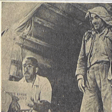
Lutheran World Federation in Jordan distribute canned food among victims of the recent civil war. Food and other supplies were sent to the area by churches in Scandinavia, West Germany, and the United States.

—by reading the top-priority stories of churches and religion in your church's newspaper every week... on the inside pages!