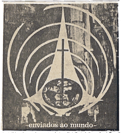
A striking four-color poster being distributed throughout Brazil announces the Fifth Assembly of the Lutheran World Federation in Porto Alegre in July, 1970.