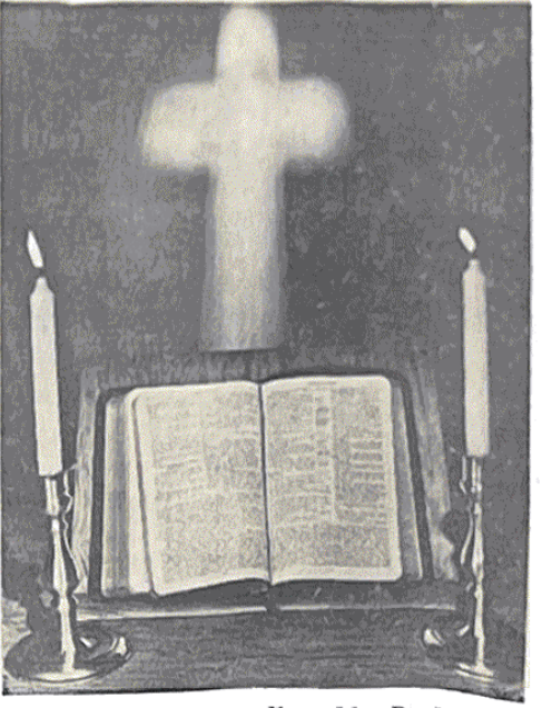
With Cross and candle, table, Book, and chair

This room was made congenial to prayer. A seeming age I sat, head bowed alone— Aware at last that barriers my own Rebellious heart had reared, must fall before I pray—to thank, confess, entreat, adore. I ask forgiveness, sense compassion steal. Within, and feel his presence near.