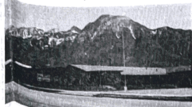
Holladay Baptist, Salt Lake City, Utah