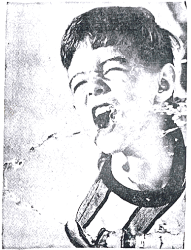
A young boy enjoys antics at a water fountain during a Sunday school picnic on a hot day.