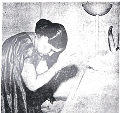
Ceylon's new prime minister, Mrs. Sirimavo Bandaranaike, worships in the Queen's House in Colombo after taking office. Mrs. Bandaranaike, a Buddhist educated in a Roman Catholic school, has promised to restore Sunday as a holiday for Ceylon Christians.

I am glad to live in the United States 'cause I can say what I think . . . and if I can't think, I can say it anyway.—World Call.