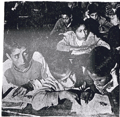
"No country can afford to leave half of its population in ignorance," Rene Maheu, director-general of UNESCO, has said. Typical of efforts to educate neglected children is the classroom scene from one of Jordan's refugee camps for Arabs.

member F.D.I.C.— Irving, Texas 75060 DIAL BL 3-4111 All Departments