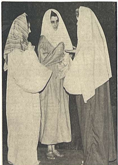
"Whither thou goest, I will go"

"Regular Haircuts and Styling" Appointments Available