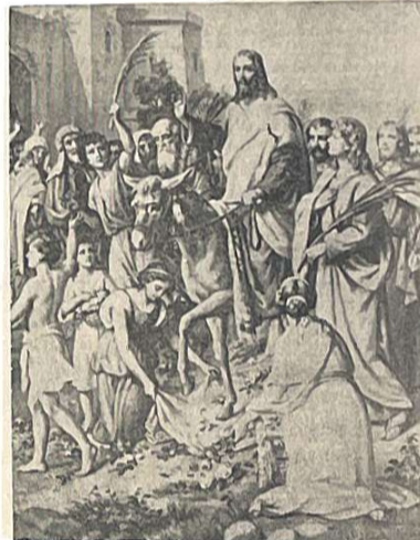
Hosanna! Blessed is he who comes in the name of the Lord! Hosanna in the highest!