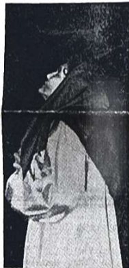
"Woman, behold thy son"