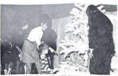
IT WAS A "PRAISE THE LORD" DAY ALL THE WAY!

Our Fourth White Christmas service was the best yet. Isn't that just like the Lord? $16,128.39 pledged and $9,085.73 received in cash! To God be the Glory for all of it. It is His Spirit within MBBC that creates the sacrificial giving that makes a great offering like this. It is the Spirit of God that creates a burden for the unsaved that impels us to give an offering like this. It is the Lord's Spirit that creates the desire to let Jesus be Lord in all things that makes possible an offering like this. It's just Jesus all the way, and we praise Him for it.