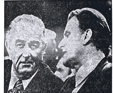
LBJ Gets the Word Former President Lyndon B. Johnson (left) chats with evangelist Billy Graham on the speakers' platform shortly before the evangelist addressed the Greater Southwest Billy Graham Crusade at Texas Stadium in Irving, Texas. Mr. and Mrs. Johnson were among dignitaries attending the Crusade.