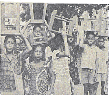
Nigerian youngsters carry their stools to class as schools reopen with UNICEF aid. During the 2 1/2-year civil war, UNICEF supplied more than 100 million pounds of food and medicines to save children's lives on both sides. Now the United Nations Children's Fund is helping Nigeria restore its schools and health services.