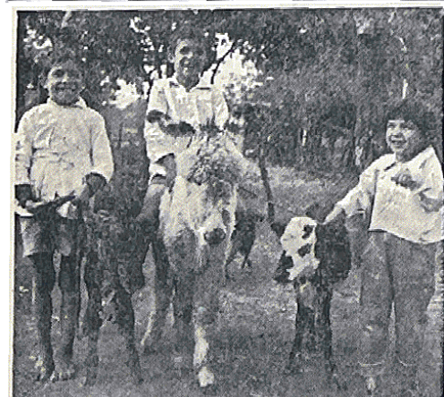
These smiling Paraguayan boys are on their way to recovery from leprosy via drugs supplied by the United Nations Children's Fund (UNICEF). Their sister, right, is not afflicted with the disease. UNICEF aid has reduced incidence of leprosy in Paraguay, where one in every 400 children was ill of it a decade ago.