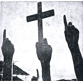
A graphic moment capturing the moving mood of Explo '72 at the final Cotton Bowl rally — the Cross of Savior flanked by the "One Way" sign indicating Christ as Savior, all held aloft by unseen Explo '72 delegates as the sun began to set on the International Student Congress on Evangelism in Dallas.