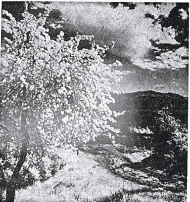
"For behold I create new heavens and a new earth." (Is. 65:17 RSV)