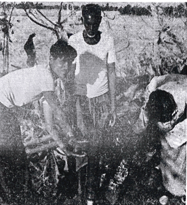
Pakistanis fit a pump to a new well providing safe drinking water in the storm-ravaged lowlands through cooperation of Southern Baptist missionaries.

He who is small in faith will never be great in anything but failure.—The Link.