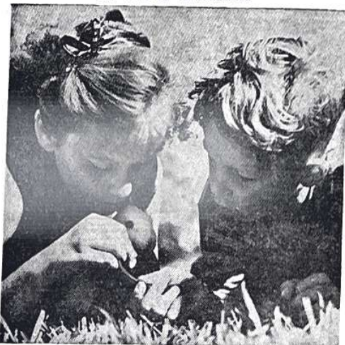
A boy and a girl make friends with a rabbit. Where once they would have named him Peter Cottontail, the chances are now high he'll be called Bugs Bunny.