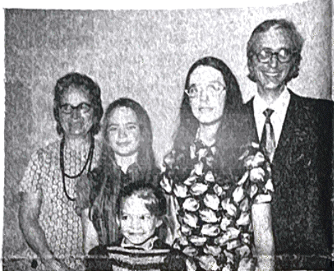
The Charles Butt Family